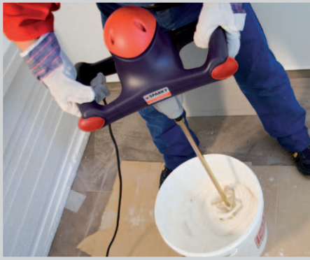
Wrap round handle for perfect balance

BM2 1060CE Plus: Paddles SM 120x570 and SM 121x570, Spanner SW22